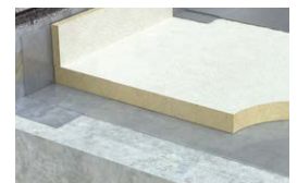
Typical Installation - Concrete Deck

Compatible with adhesively bonded single ply roofing membranes laid on mechanically fixed or adhered boards.