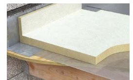
Typical Installation - Timber Deck